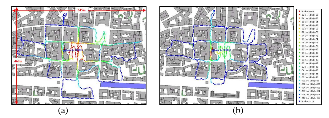
Figure 1: Femtocell outdoor coverage for a transmitter located a) close to the window b) deep inside the building

Since the femtocells are installed inside of the buildings, the moving people will block intermittently the signal transmitted from the femtocell or the interfering signals coming from the macrocell. Those issues are currently investigated in the IEEE 802.11n and COST2100. One of the objectives pursued by FREEDOM is to get a realistic channel model for indoor and outdoor-to-indoor transmissions. Thus two coherent approaches will be followed. On one side a propagation model will be proposed to determine the indoor and outdoor coverage resulting from indoor femto transmitter. The impact of the transmitter location inside the building will lead to different outdoor coverage. This will model the observation made on initial measurement campaigns represented in Figure 1. In this Figure, the transmitter is located deeply inside the building or close to the window. The possible range of interference of the femtocell in the surrounding environment may be observed.